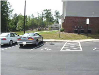
Painted access aisle

1. Are the handicap parking spaces oversized or do they include a painted access aisle?