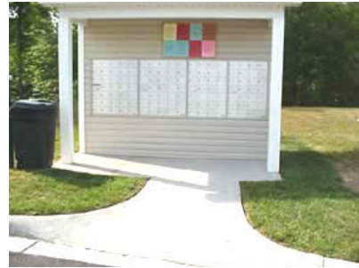
Wide sidewalk with access ramp

2. Are the tenant mailboxes on an accessible route?